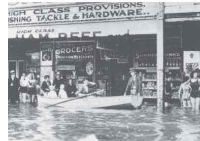
1942 - Narrabeen Flood