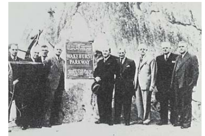
1946 - Wakehurst Parkway Opening

The timeline overleaf shows that within 200 years of Europeans arriving, they had dramatically changed the landscape and the lagoon's ecology.