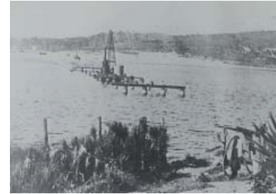
1925 - Ocean Street Bridge Construction

Some 100 years later, even with many land grants and farms, it was still renowned for its natural beauty and wildlife - popular with day trippers for boating, bathing and picnics, especially at Deep Creek up to the 1930's. With the advent of bridges, trams, then roads and cars the area was rapidly developed.