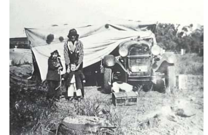
1930s - Living in Narrabeen Campground