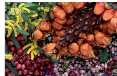
'A rich variety of bush tucker' 13

Beach dunes were high, broken by a few ancient walkways and had many shellfish middens. Winter was often spent inland (eg. Middle Harbour, Roseville) harvesting bush foods and hunting land mammals.