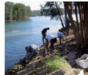
Bank Stabilisation - Narrabeen Lagoon

Though much of its natural beauty still remains today, the health of the lagoon and its catchment are under threat from the impacts of urban development – we can each help protect it by learning about our local environment, helping restore it and reducing our impacts at home and beyond.