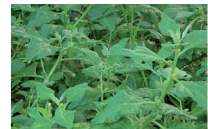
Warrigal Spinach - a bush food from the lagoon foreshores

Familiar with the times of breeding, migration, flowering and fruiting, they would harvest and encourage their favoured foods to flourish as sustainable supplies: