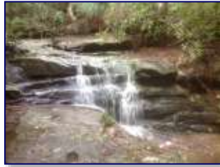
Waterfall in Wheeler Creek

Presenters: Staff members from Northern Beaches Council will outline the works needed to control erosion and protect against flooding. Plus information about the bush regeneration projects in near creeks in the catchment.