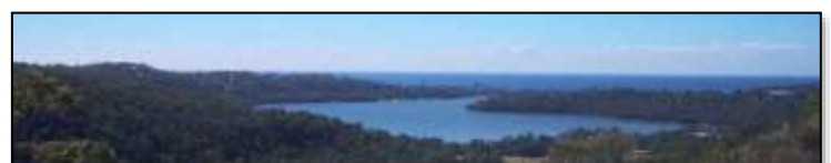
Narrabeen Lagoon seen from within the catchment to the west.

Four contracts have been underway within the Deep Creek region with two focusing on bush regeneration and two on bushfire hazard reduction activities. A bush regeneration contract has focused on the core areas of bushland and along riparian creek-line. Works included substantial weed control and revegetation of 200 tube stock plants focusing on areas of low biodiversity values.