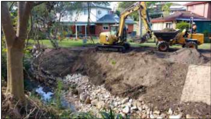
Bank stabilisation works along South Creek during 2018