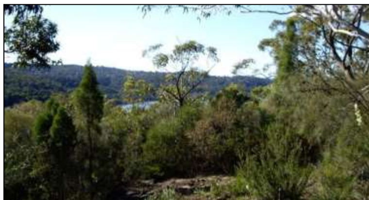
View of Narrabeen Lagoon catchment