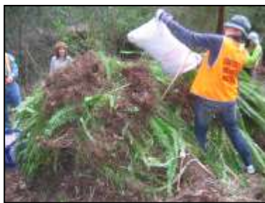
Bush regeneration in the catchment

Bring your concerns and questions to the forum on August 27 and find out more about creek care from Council staff.