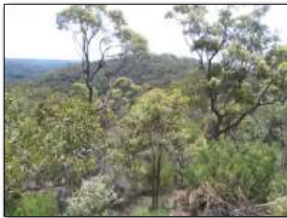
Narrabeen Lagoon Catchment

Start 9am - finish 1.30pm. This walk is a hidden gem. Also lovely scenic views and sometimes rare fauna. Plant ID as we go and a brief lunch break BYO. Carpool back.