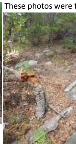
Grass trees cut down to make the track

These photos were taken in February 2018 between Woorarra Ave and Deep Creek In Elanora Heights.