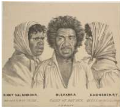
Aboriginal people of the Sydney area.

The Coastal Environment Centre is adjacent to the Narrabeen Caravan Park near where Narrabeen Lagoon joins the sea.