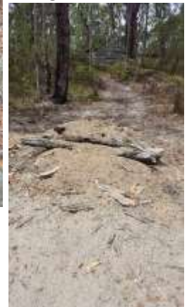
Erosion taking place

These photos were taken in February 2018 between Woorarra Ave and Deep Creek In Elanora Heights.