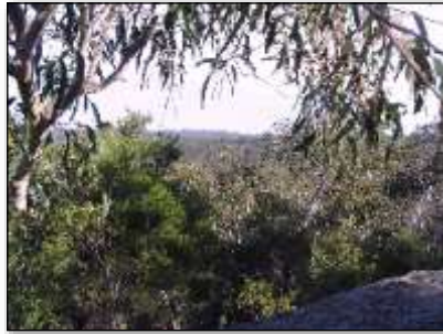
Narrabeen Lagoon Catchment

Start 10am at Terrey Hills and allow 3 hours and bring a screwdriver for some voluntary weeding near the end of the track. See and identify spectacular Sydney sandstone flora in "autumn" blossom. Carpool required.