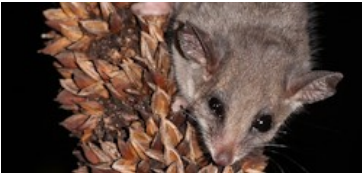
Eastern Pygmy Possum