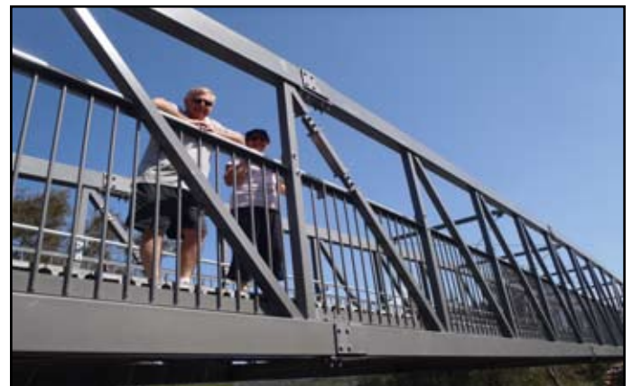
The completed bridge over Deep Creek

The plans for Middle Creek Reserve have been finalised. The bridge over Deep Creek is finished. The official opening for Stage 1 of the Narrabeen Lagoon Trail and Deep Creek Bridge will be Oct 13 at Middle Creek Reserve at 10:30am. RSVP before Oct 10 by phoning 9942 2502 if you plan to attend.